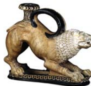
An Etruscan terracotta perfume flask in the form of a lion made at Chiusi in the 4th century BC, close to modern day Lazio, Italy. The elaborate form and additional decoration in gold suggests these objects were made for a wealthy clientele.

Fragrances have been affecting our mood and wellbeing for thousands of years. 1 The Greeks, Romans, Egyptians and Chinese all used essential oils, not only for bathing and perfume, but for healing as well. Today, the therapeutic power of scent is recognised in the practice of aromatherapy.